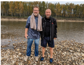
Rising Above's Executive Director and Operations Manager baptized participants in early September, 2023!